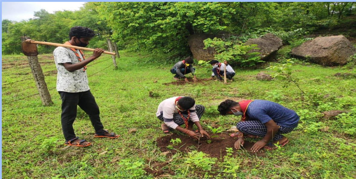
PLANTING TREES IN AND AROUND COLLEGE PREMISES AS A TWIN ACTIVITY -RELEASING STRESS AND MAKING AWARENESS ABOUT ENVIRONMENT

On June 7, 2020, an online Stress Relief Workshop was conducted by Dr. Sunanth TS Raj , organized by the Health Club Wing of PTM College of Education. Given the surge in anxiety and stress levels due to the COVID-19 pandemic, the workshop aimed to provide attendees with effective strategies to manage their mental health during these challenging times.