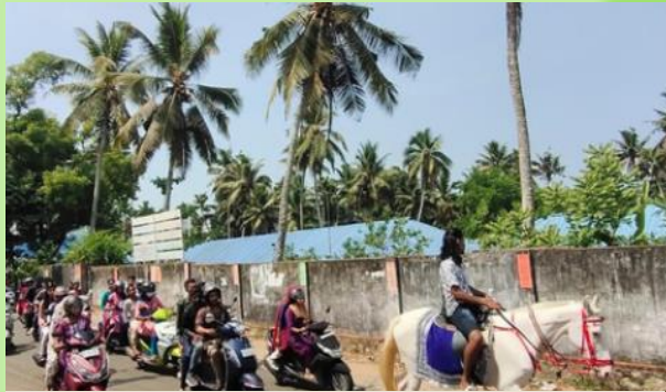
Educational summit Proclamation

(Recognised by : NCTE and Affiliated to Kerala University)