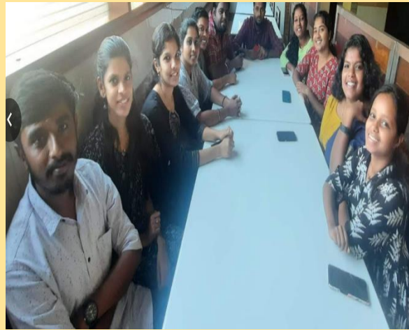
Vocabulary enrichment programme organized by Malayalam department