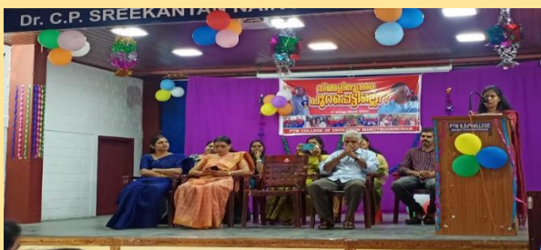
Anchoring by students on various programmes organized by college